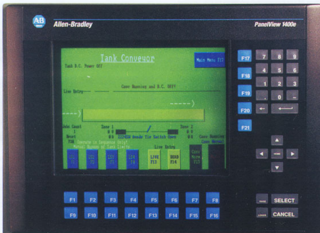
Example of the Panel View screen while monitoring the electrocoating process.

contains a modem. This allows the project engineer at Spang Power Electronics to monitor the process from his own computer. This can allow him to review diagnostic data and perform immediate troubleshooting or programming changes as needed.